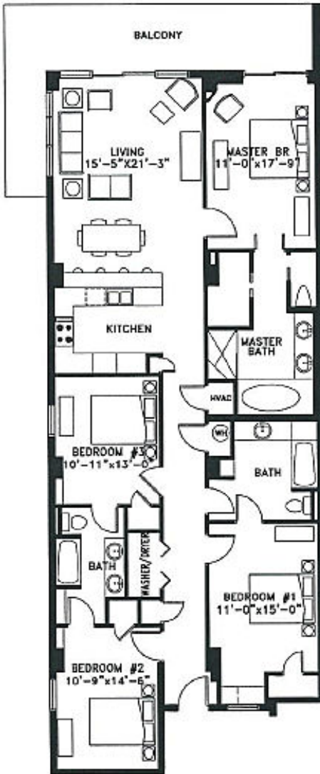
EAST SIDE UNIT

27070 Perdido Beach Blvd | Orange Beach, AL 36561